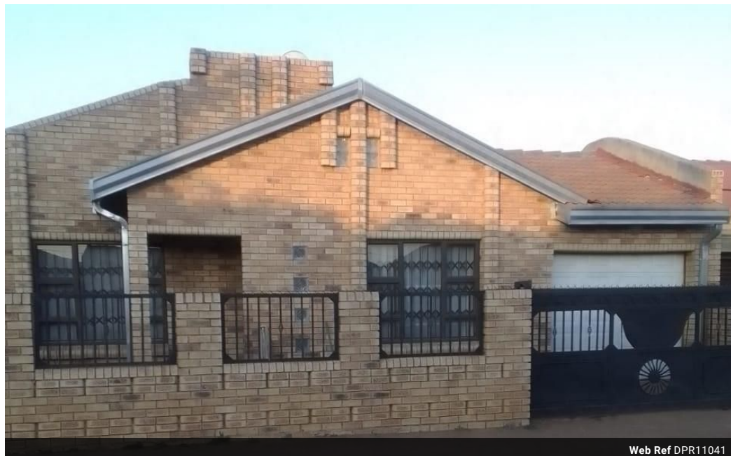
Web Ref DPR11041

Shop 2, The Palms Shopping Center, Louis Trichardt Blvd, Vanderbijlpark, 1911