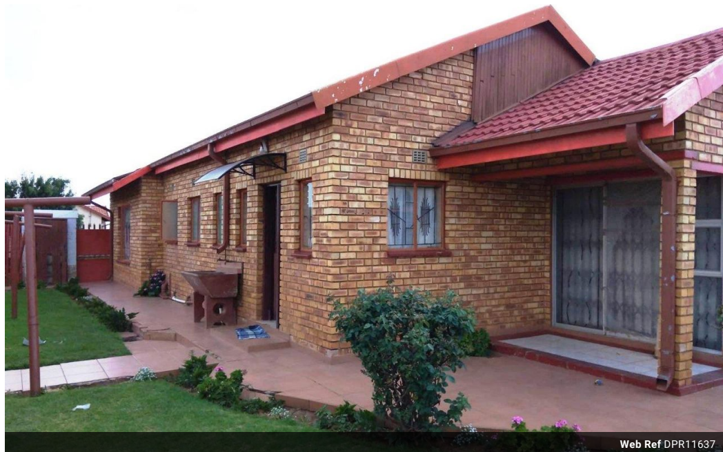
Web Ref DPR11637

Shop 2, The Palms Shopping Center, Louis Trichardt Blvd, Vanderbijlpark, 1911