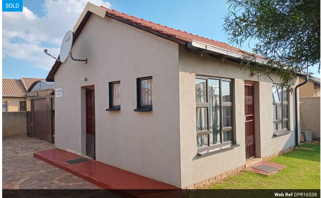
Web Ref DPR16538

Shop 2, The Palms Shopping Center, Louis Trichardt Blvd, Vanderbijlpark, 1911