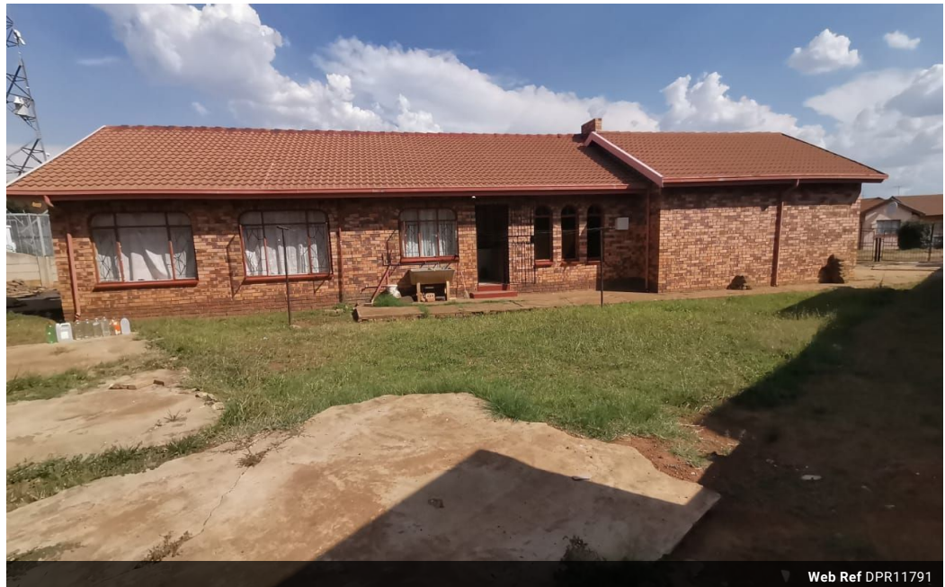
Web Ref DPR11791

Shop 2, The Palms Shopping Center, Louis Trichardt Blvd, Vanderbijlpark, 1911