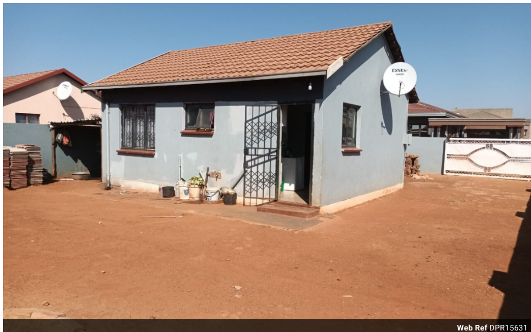
Web Ref DPR15631

Shop 2, The Palms Shopping Center, Louis Trichardt Blvd, Vanderbijlpark, 1911