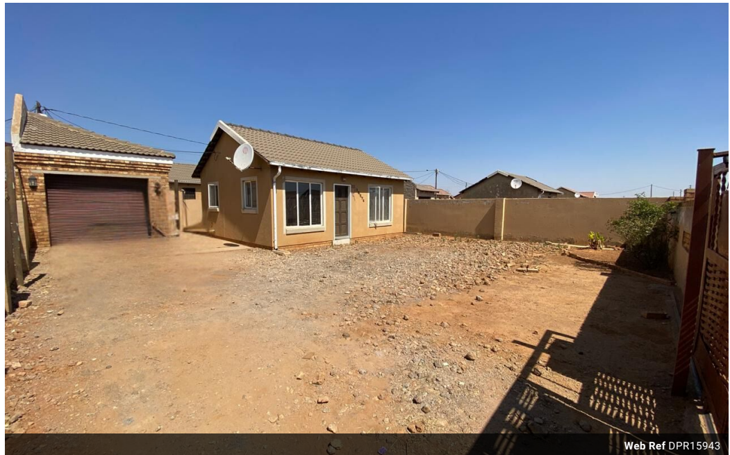
Web Ref DPR15943

18 Klipriver Drive Three Rivers Vereeniging