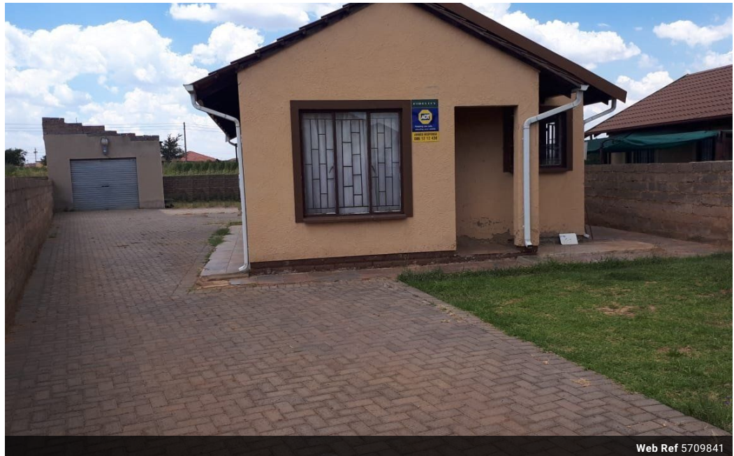
Web Ref 5709841

18 Klip River Drive, Three Rivers, Vereeniging