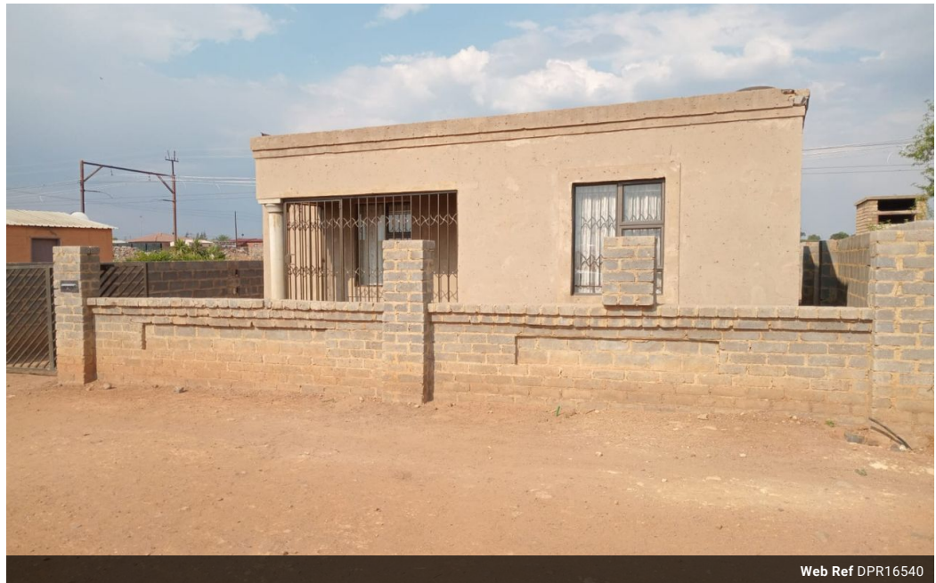
Web Ref DPR16540

Shop 2, The Palms Shopping Center, Louis Trichardt Blvd, Vanderbijlpark, 1911