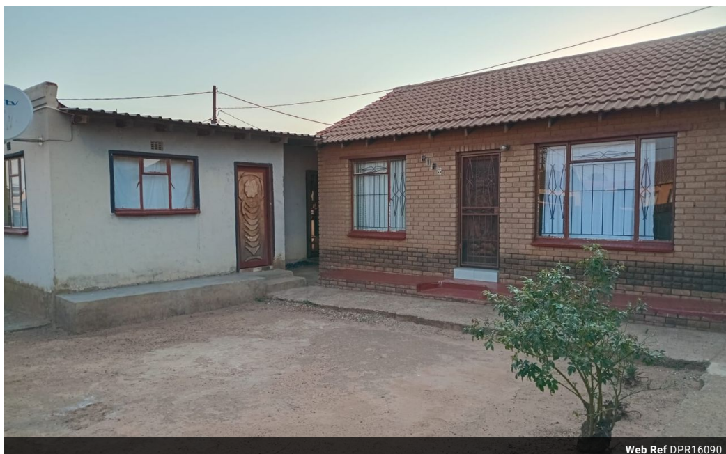
Web Ref DPR16090

Shop 2, The Palms Shopping Center, Louis Trichardt Blvd, Vanderbijlpark, 1911