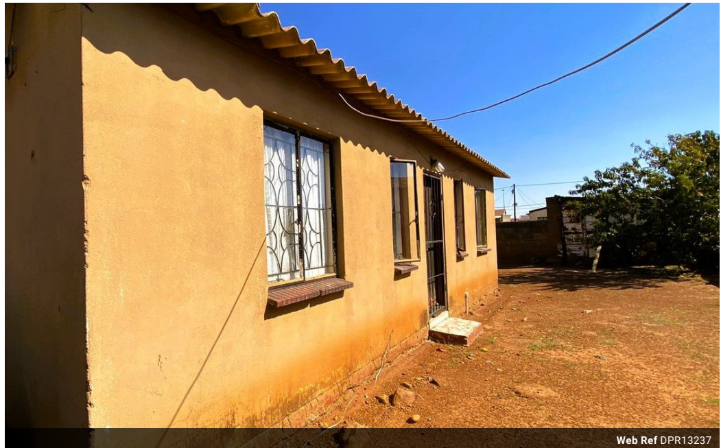
Web Ref DPR13237

18 Klipriver Drive Three Rivers Vereeniging