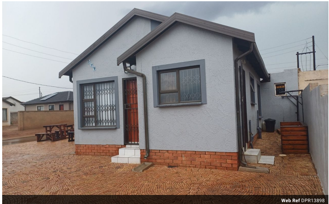
Web Ref DPR13898

Shop 2, The Palms Shopping Center, Louis Trichardt Blvd, Vanderbijlpark, 1911