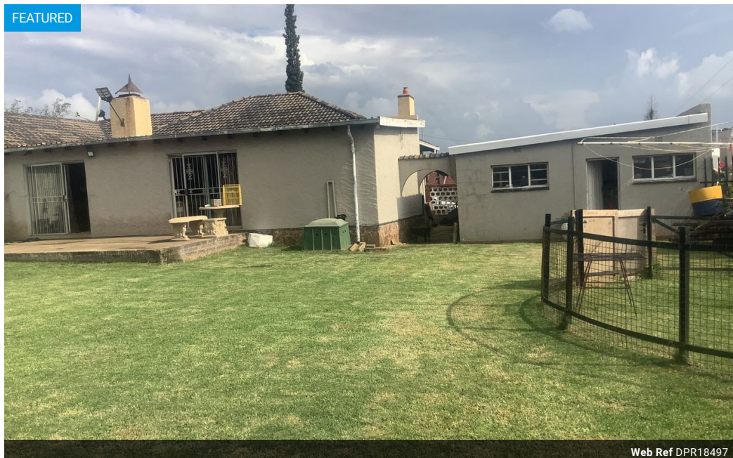
Web Ref DPR18497