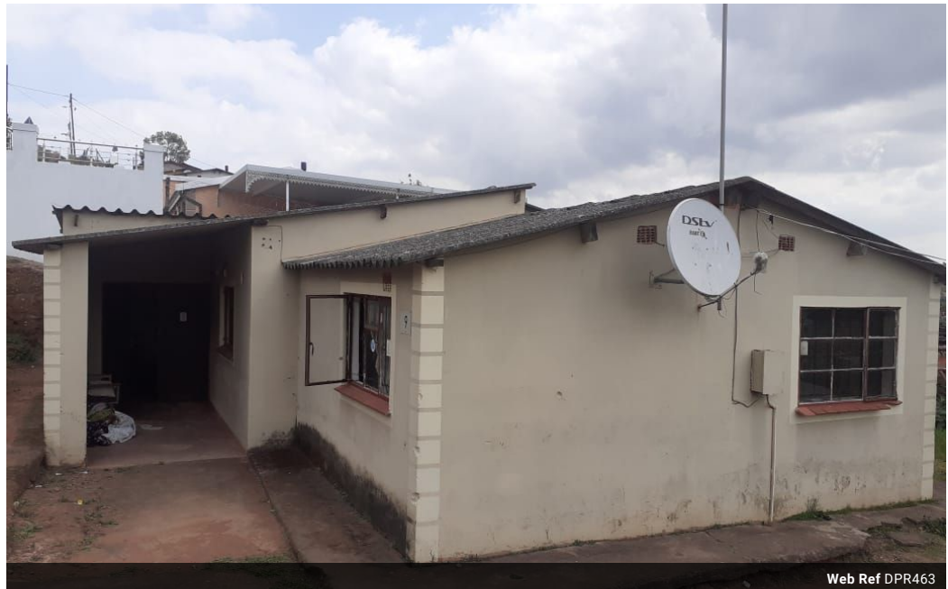
Web Ref DPR463