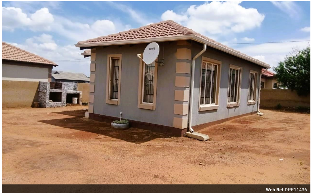
Web Ref DPR11436

18 Klip River Drive Three Rivers Vereeniging