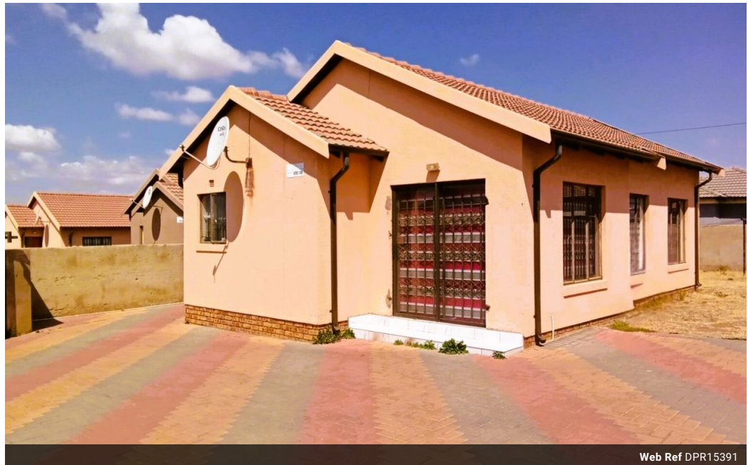
Web Ref DPR15391

18 Klip River Drive Three Rivers Vereeniging