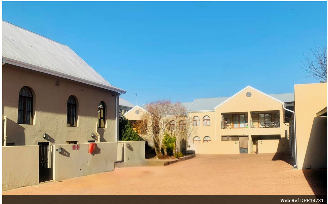
Web Ref DPR14731

18 Klip River Drive Three Rivers Vereeniging