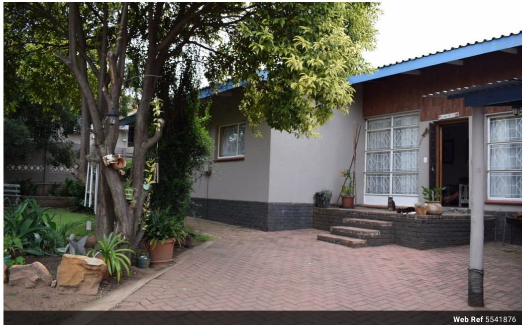
Web Ref 5541876

18 Klip River Drive, Three Rivers, Vereeniging