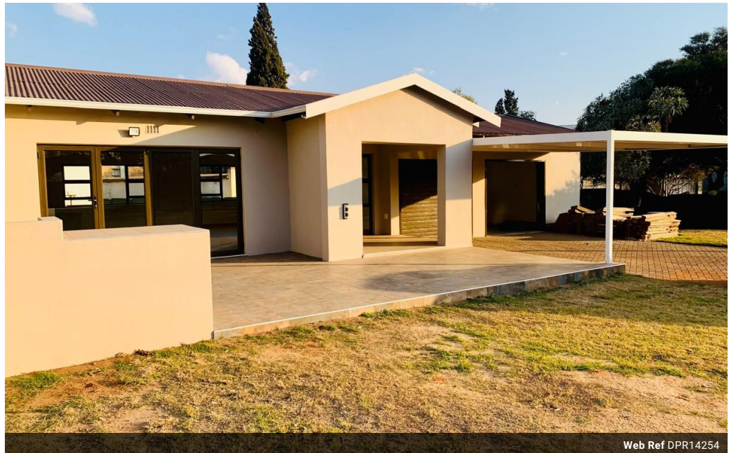
Web Ref DPR14254

18 Klip River Drive Three Rivers Vereeniging