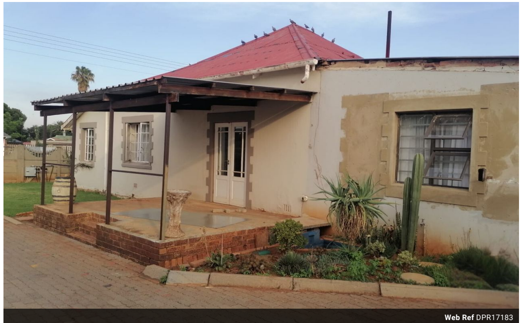
Web Ref DPR17183

18 Klip River Drive Three Rivers Vereeniging