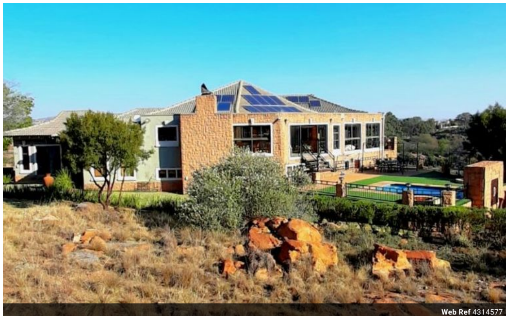
Web Ref 4314577

18 Klip River Drive, Three Rivers, Vereeniging