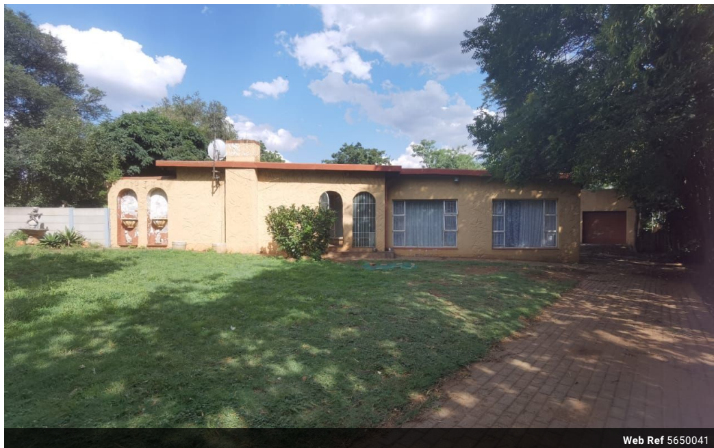
Web Ref 5650041

18 Klip River Drive, Three Rivers, Vereeniging