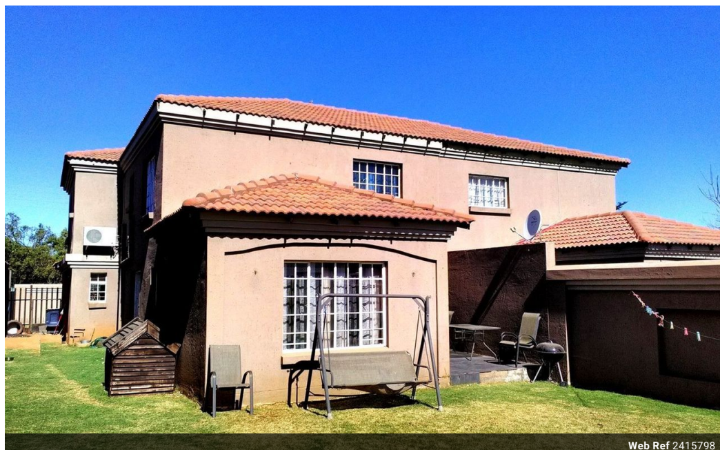
Web Ref 2415798

18 Klip River Drive, Three Rivers, Vereeniging