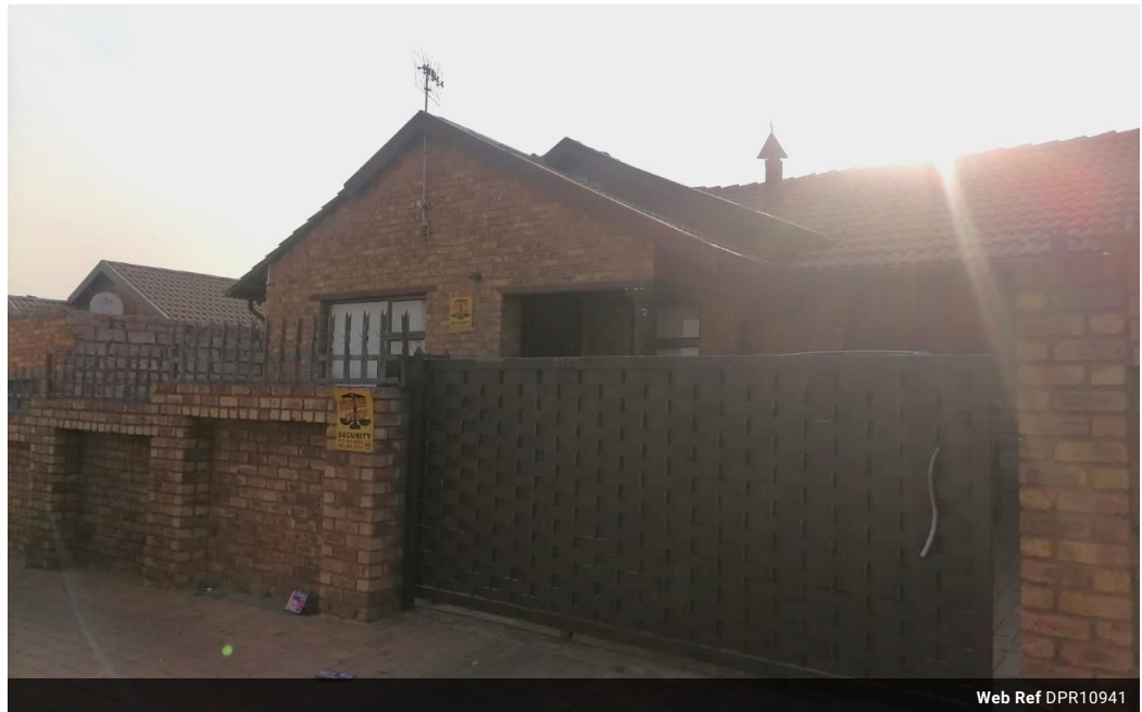
Web Ref DPR10941

18 Klip River Drive Three Rivers Vereeniging