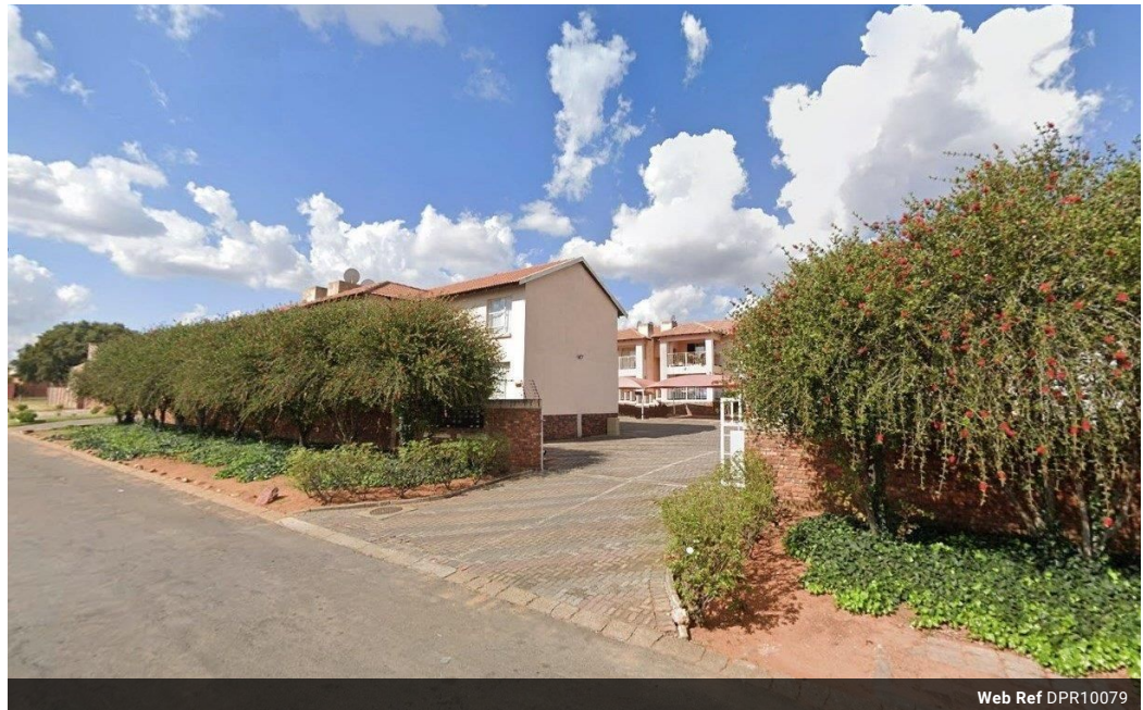
Web Ref DPR10079

18 Klip River Drive Three Rivers Vereeniging