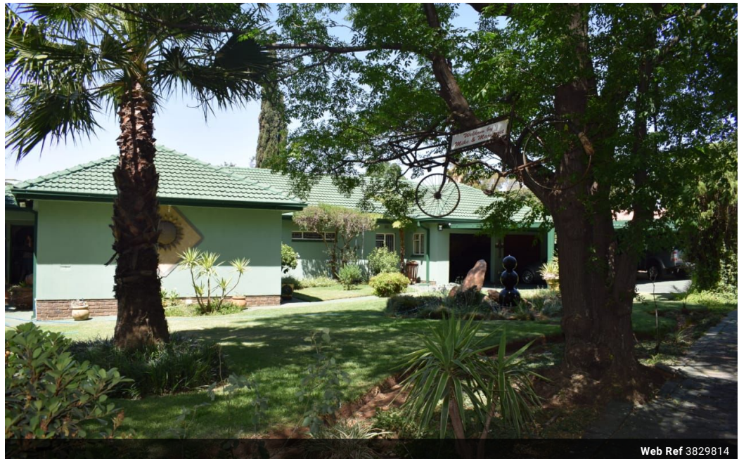
Web Ref 3829814

18 Klip River Drive, Three Rivers, Vereeniging