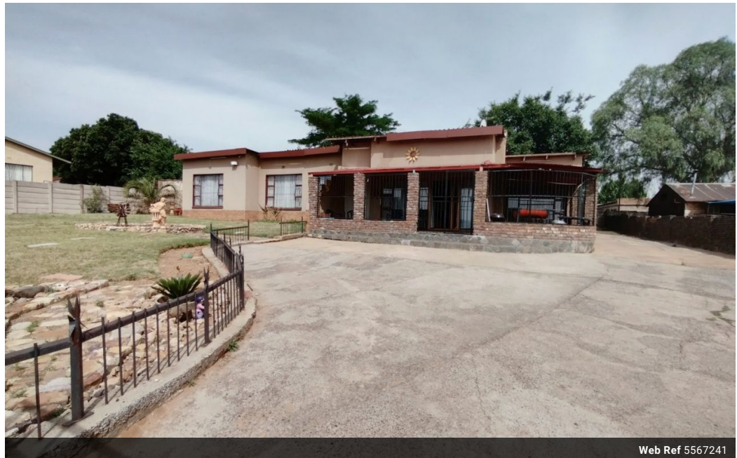
Web Ref 5567241

18 Klip River Drive, Three Rivers, Vereeniging