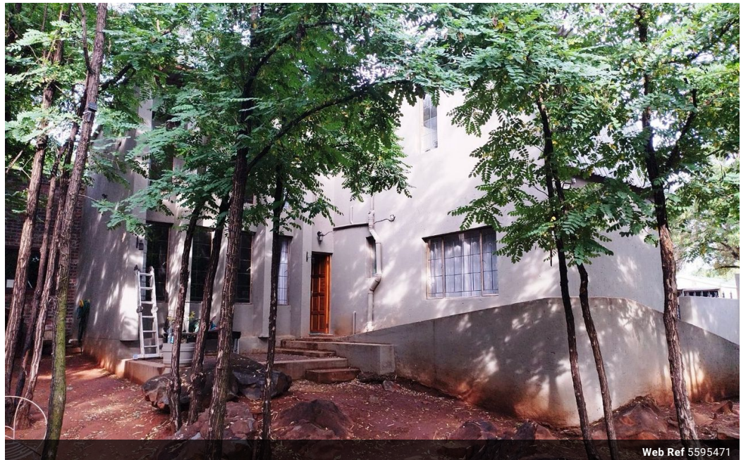
Web Ref 5595471

18 Klip River Drive, Three Rivers, Vereeniging