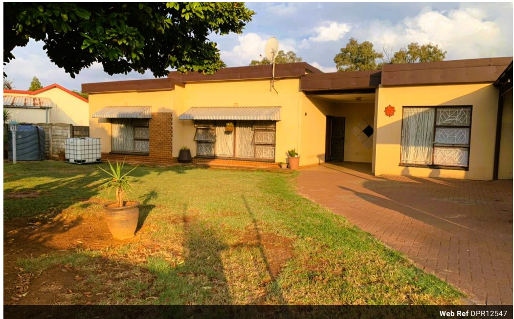
Web Ref DPR12547

18 Klip River Drive Three Rivers Vereeniging