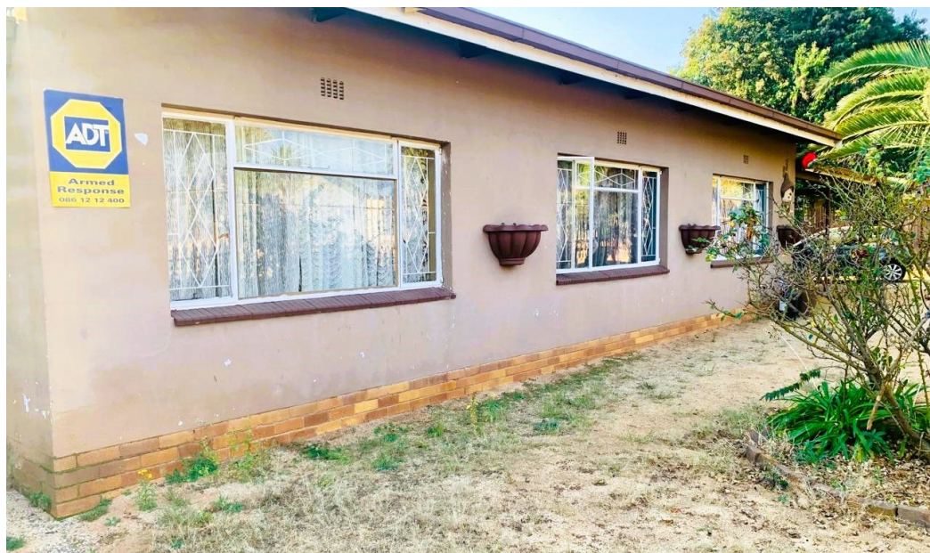
Web Ref DPR13953

18 Klip River Drive Three Rivers Vereeniging