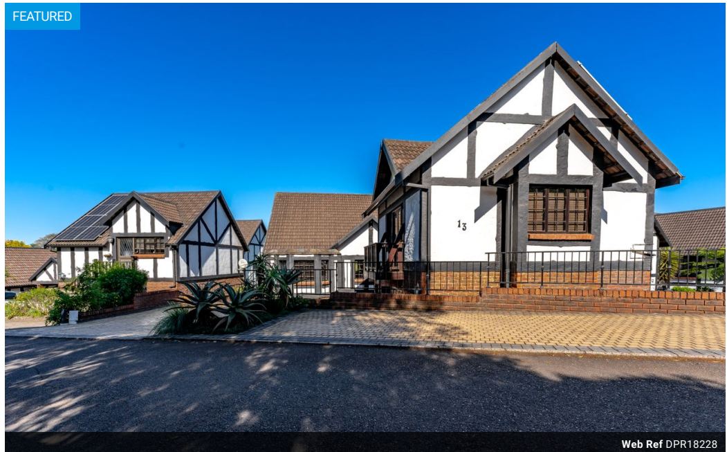
Web Ref DPR18228