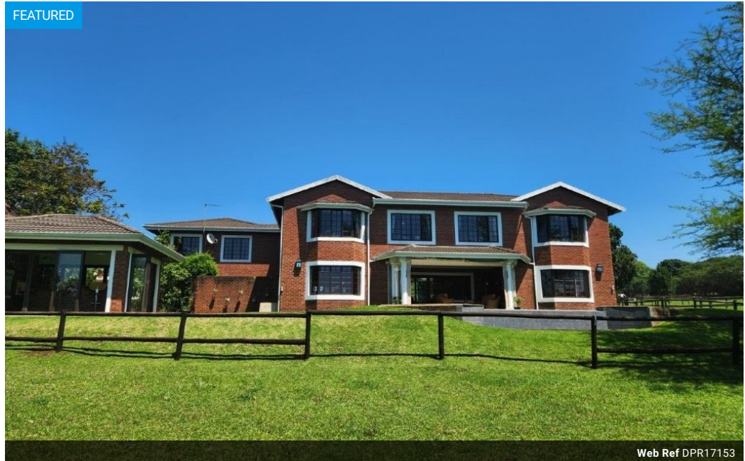
Web Ref DPR17153