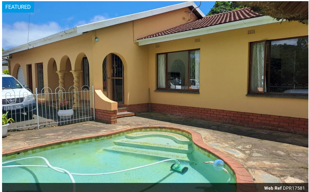
Web Ref DPR17581