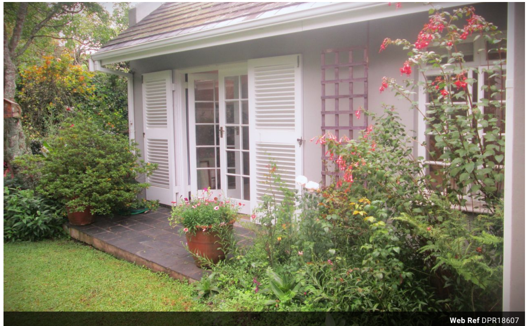
Web Ref DPR18607