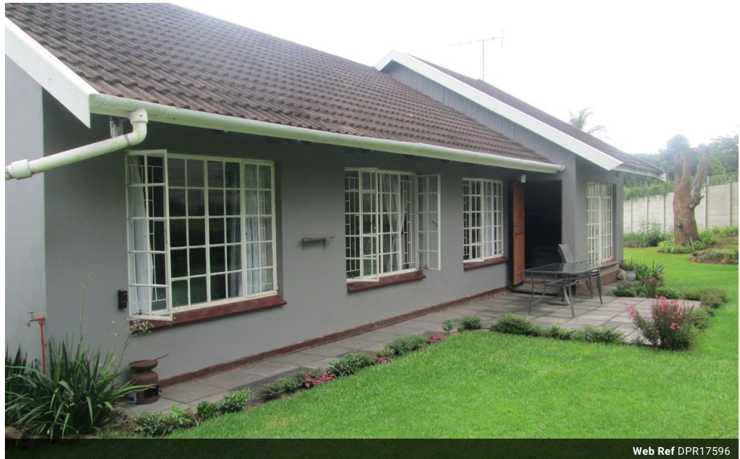
Web Ref DPR17596