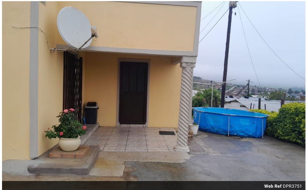
Web Ref DPR3751