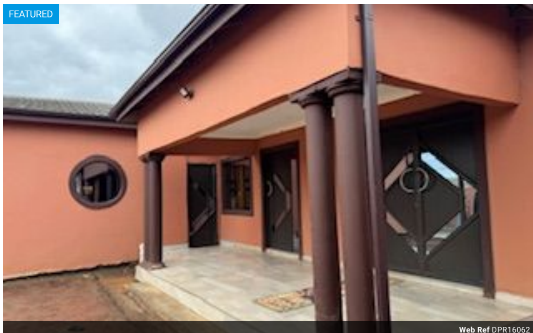
Web Ref DPR16062