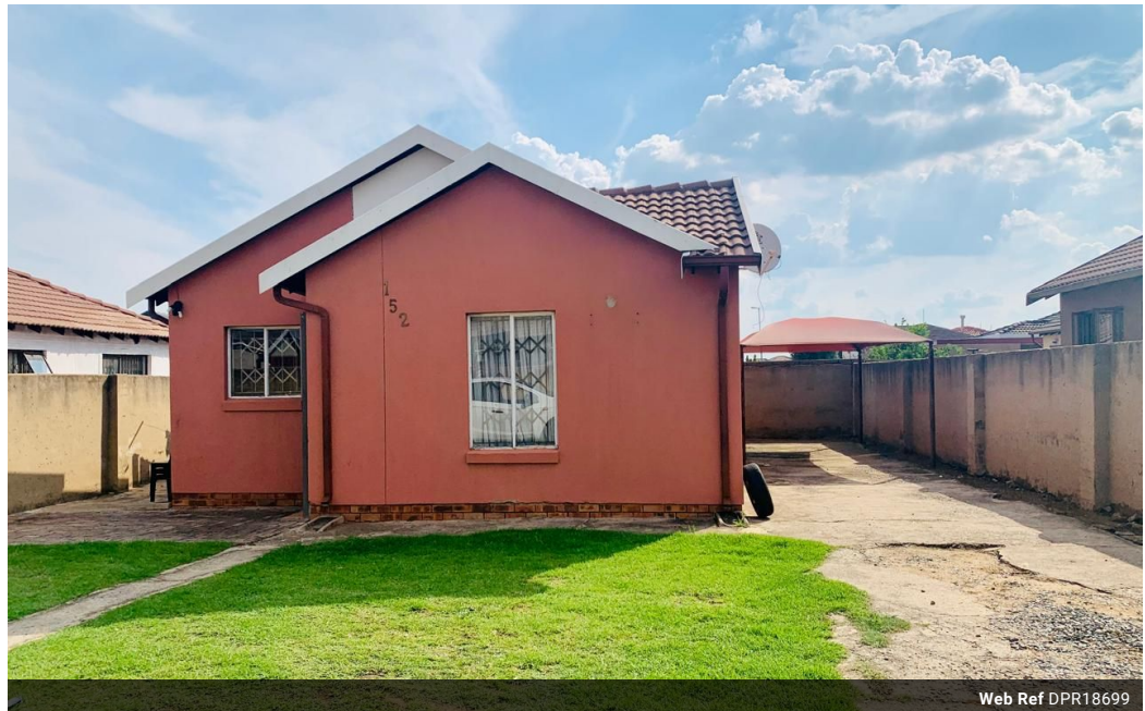
Web Ref DPR18699

18 Klip River Drive Three Rivers Vereeniging