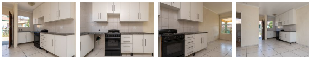
Web Ref DPR517