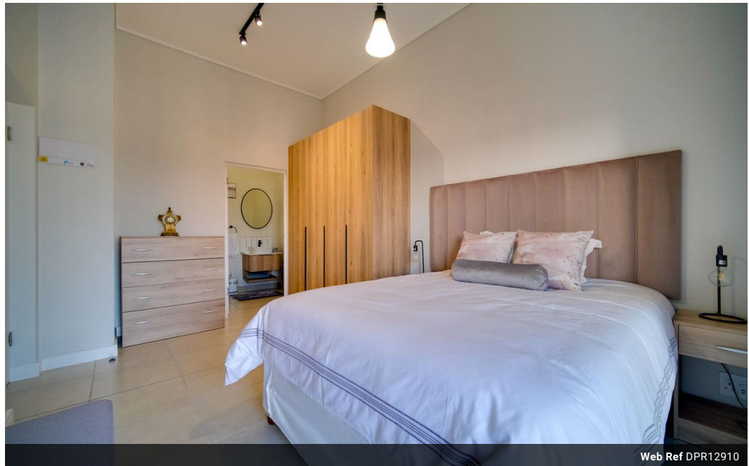
Web Ref DPR12910

95 Victoria Street, Oakdene, Johannesburg, Gauteng, 2190