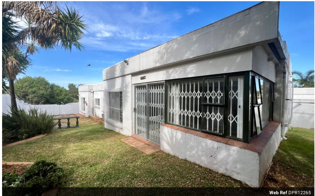
Web Ref DPR12265

95 Victoria Street, Oakdene, Johannesburg, Gauteng, 2190