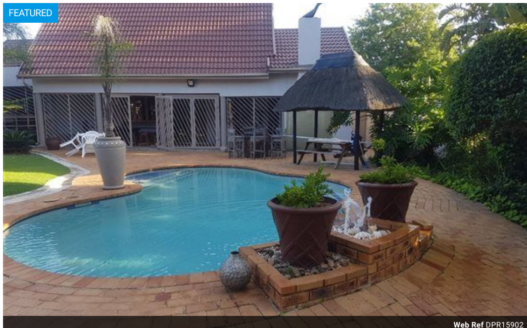
Web Ref DPR15902

Heritage Square Shopping Centre - Suite 9, Cecil Knight St, Krugersdorp North, Krugersdorp 1718