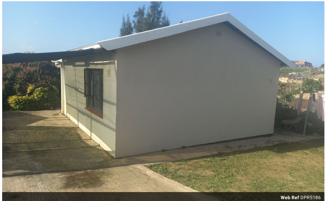
Web Ref DPR5186

343 Anton Lembede Street 511 Perm Building Durban 4001