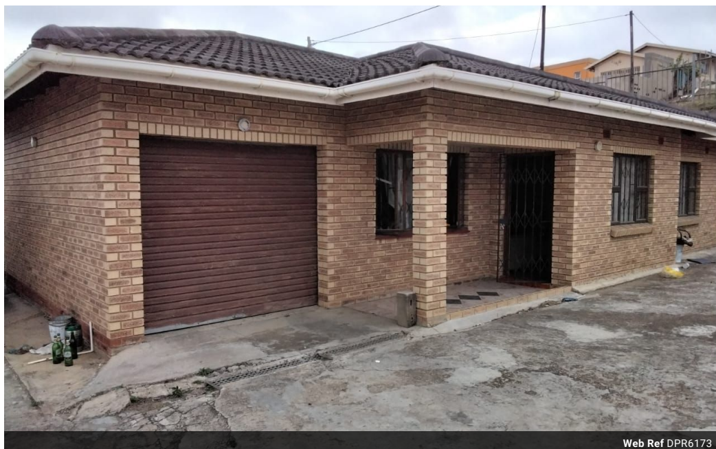
Web Ref DPR6173

343 Anton Lembede Street 511 Perm Building Durban 4001