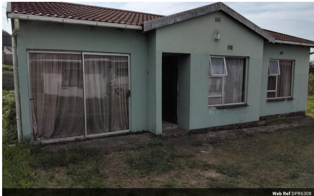
Web Ref DPR6308

343 Anton Lembede Street 511 Perm Building Durban 4001