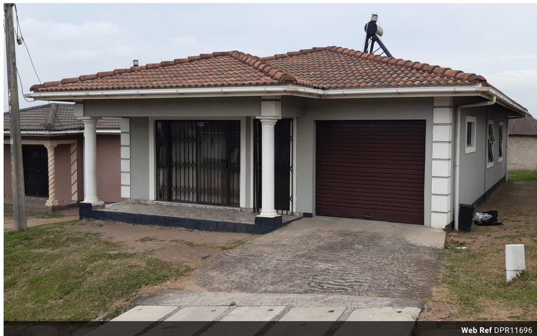
Web Ref DPR11696

343 Anton Lembede Street 511 Perm Building Durban 4001