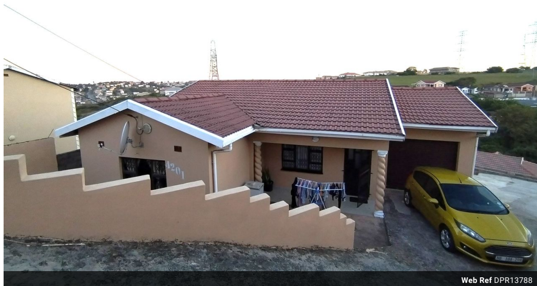
Web Ref DPR13788