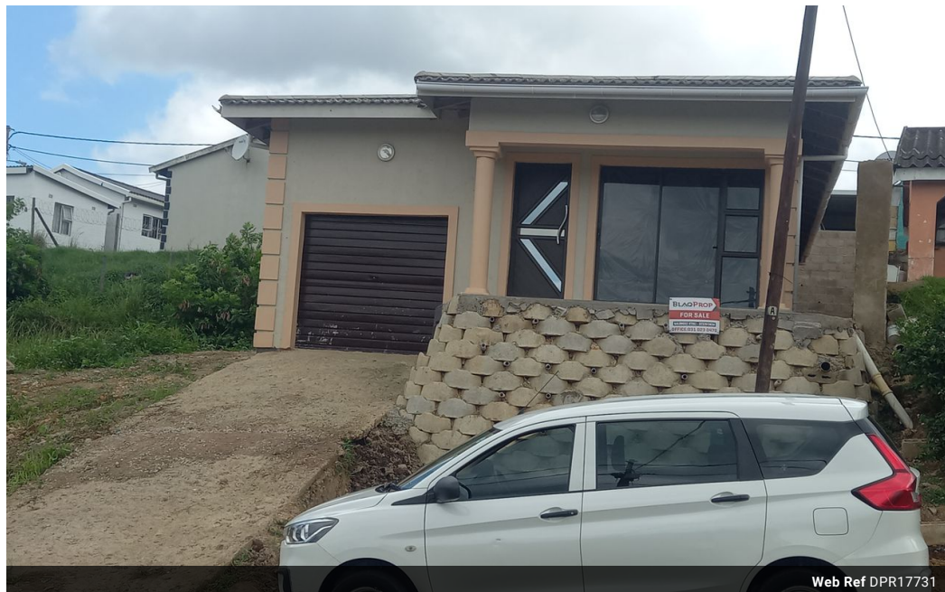
Web Ref DPR17731

343 Anton Lembede Street 511 Perm Building Durban 4001