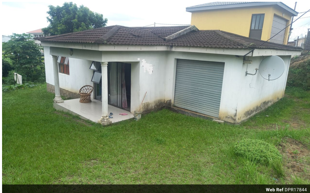
Web Ref DPR17844

343 Anton Lembede Street 511 Perm Building Durban 4001