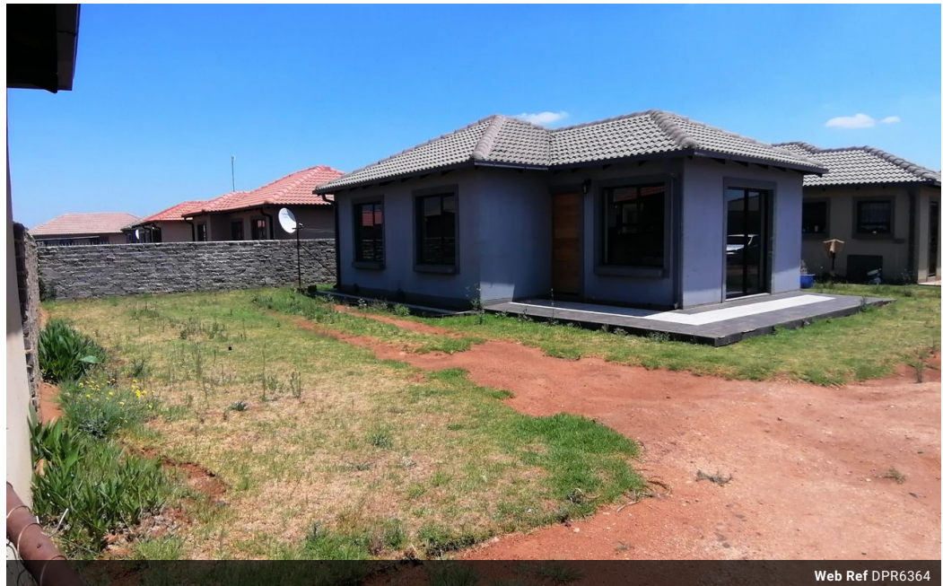
Web Ref DPR6364