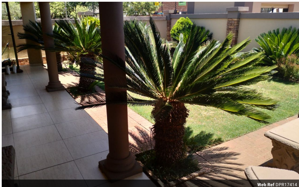
Web Ref DPR17414